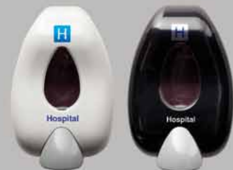
Custom logo dispensers