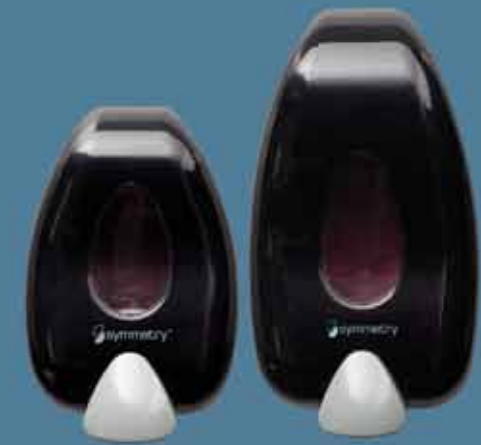
1250 ml Smoke