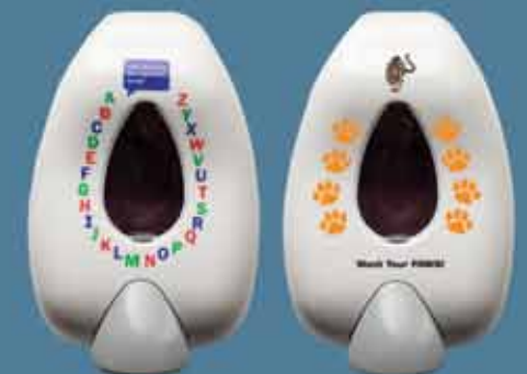
Custom logo dispensers